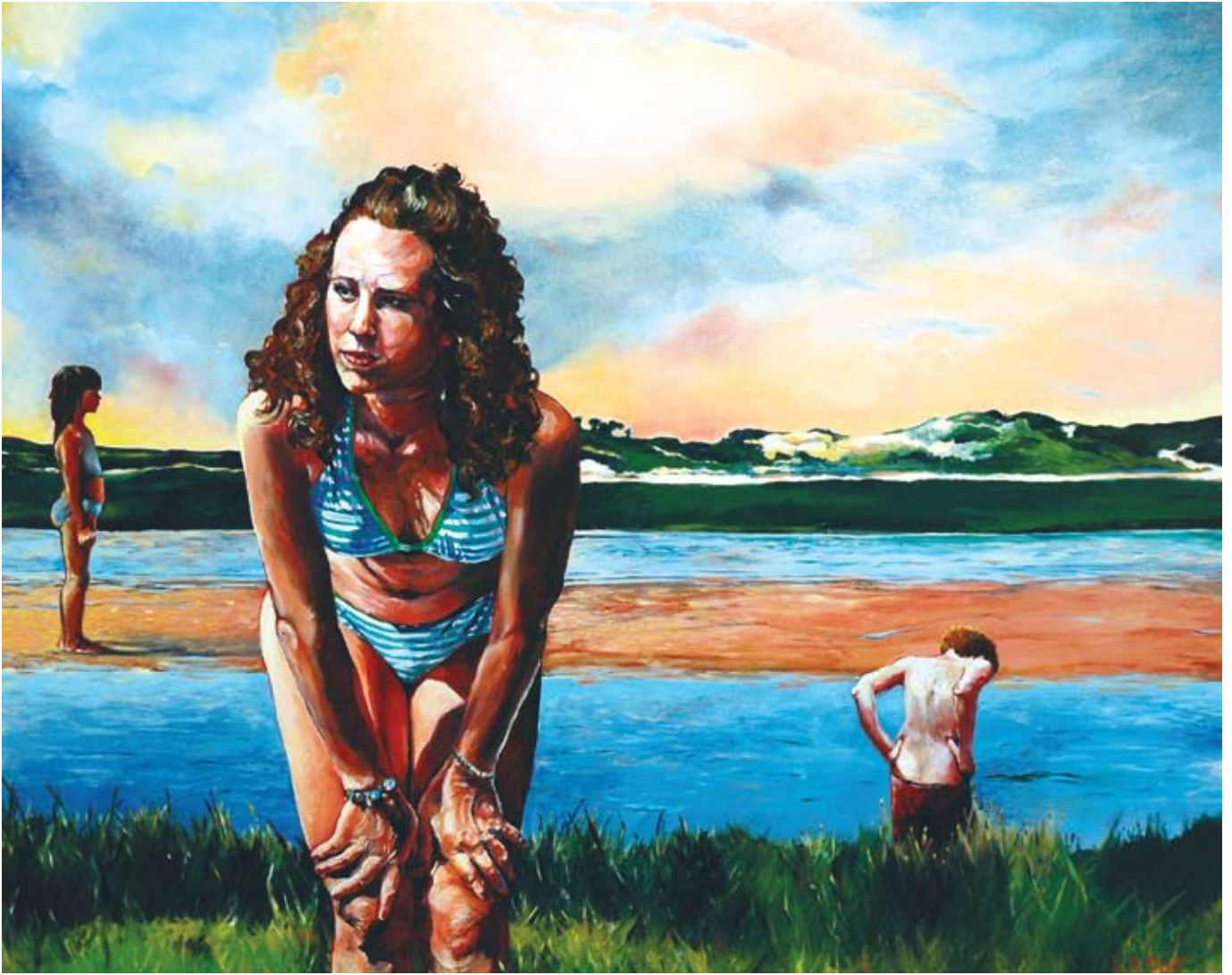
DECEPTIVE WATERS, OIL ON PANEL, 24 X 30"