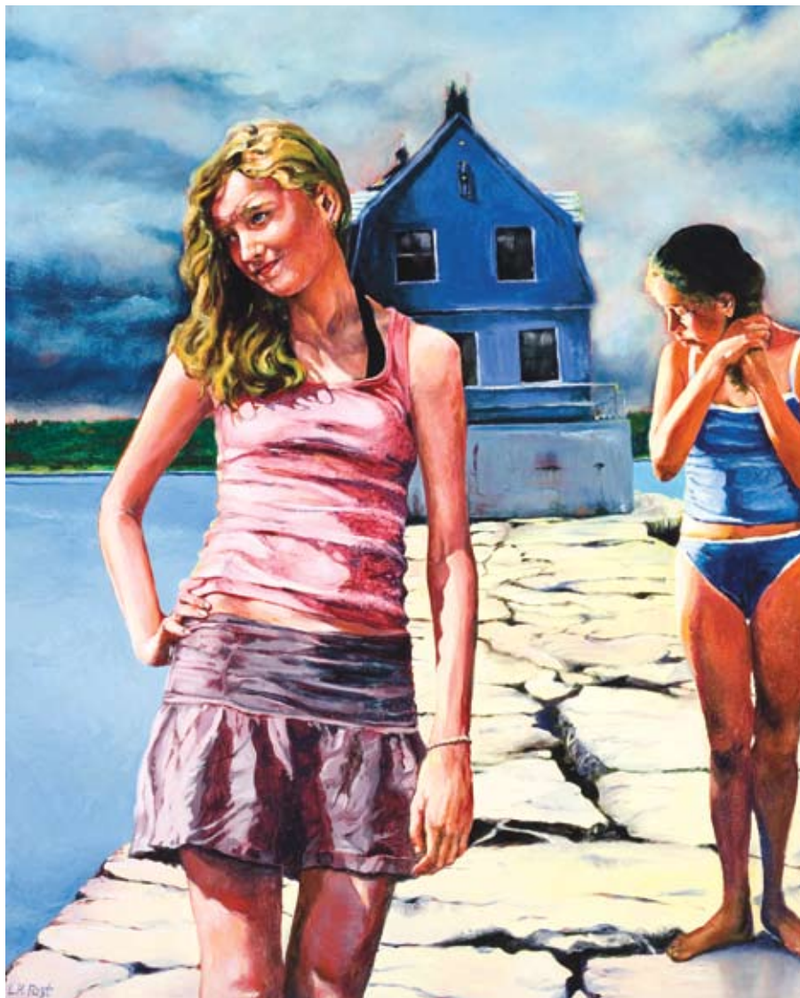
A GATHERING STORM, OIL ON PANEL, 30 X 24"

“There are always a lot of people in my paintings but they have a personal space,” adds Post. “They suggest the familiar; they’re part of our collective unconscious.”