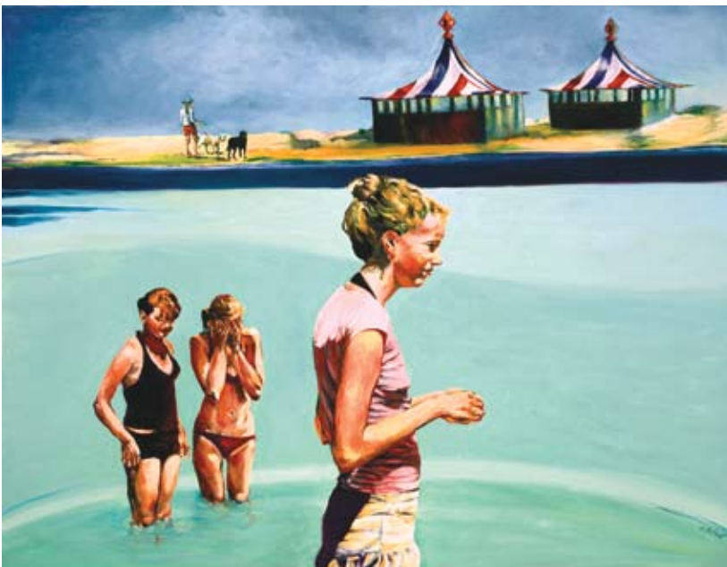
CHAPPAQUIDDICK, OIL ON PANEL, 24 X 30"