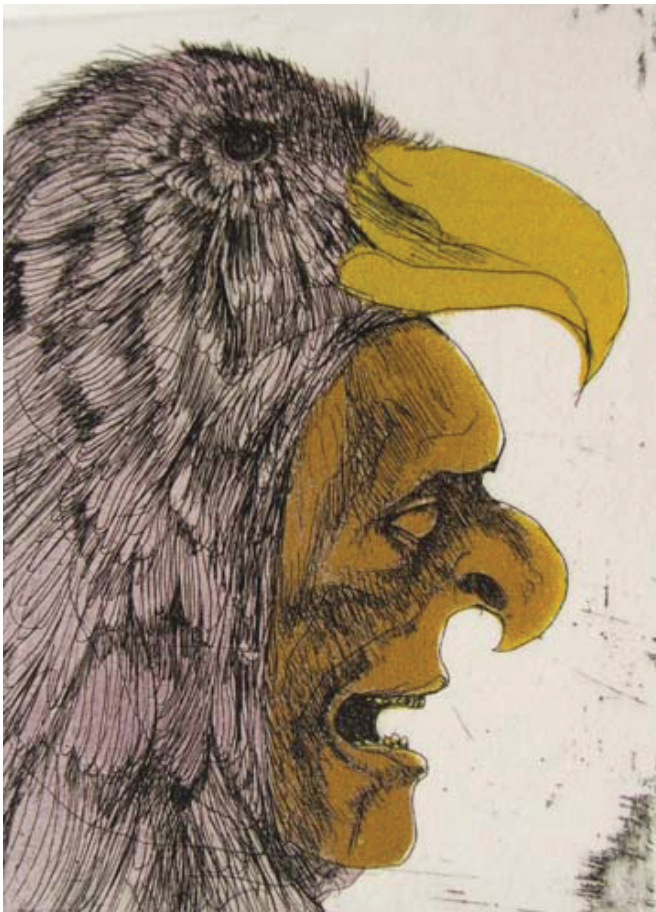
Leonard Baskin etching, Scavengers in Love, from Masks (1999)

Baskin’s work looked intensely at the world around him. His engravings, with their intricate network of sinewy anatomical lines, delicate and twisted, depicted both the inner maelstrom and the outer physicality of the human form. His work was populated by