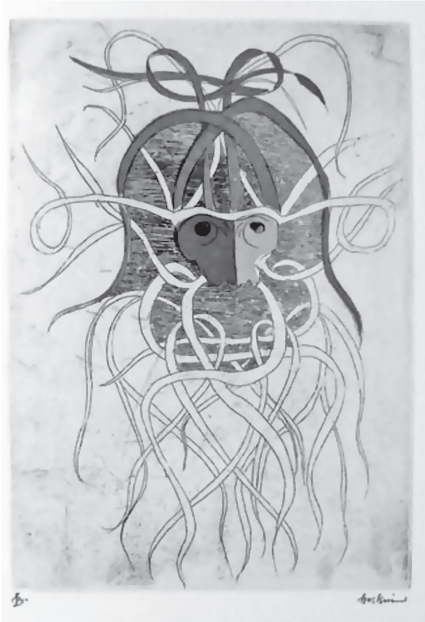
Leonard Baskin etching, About Face II, from Masks, 1999